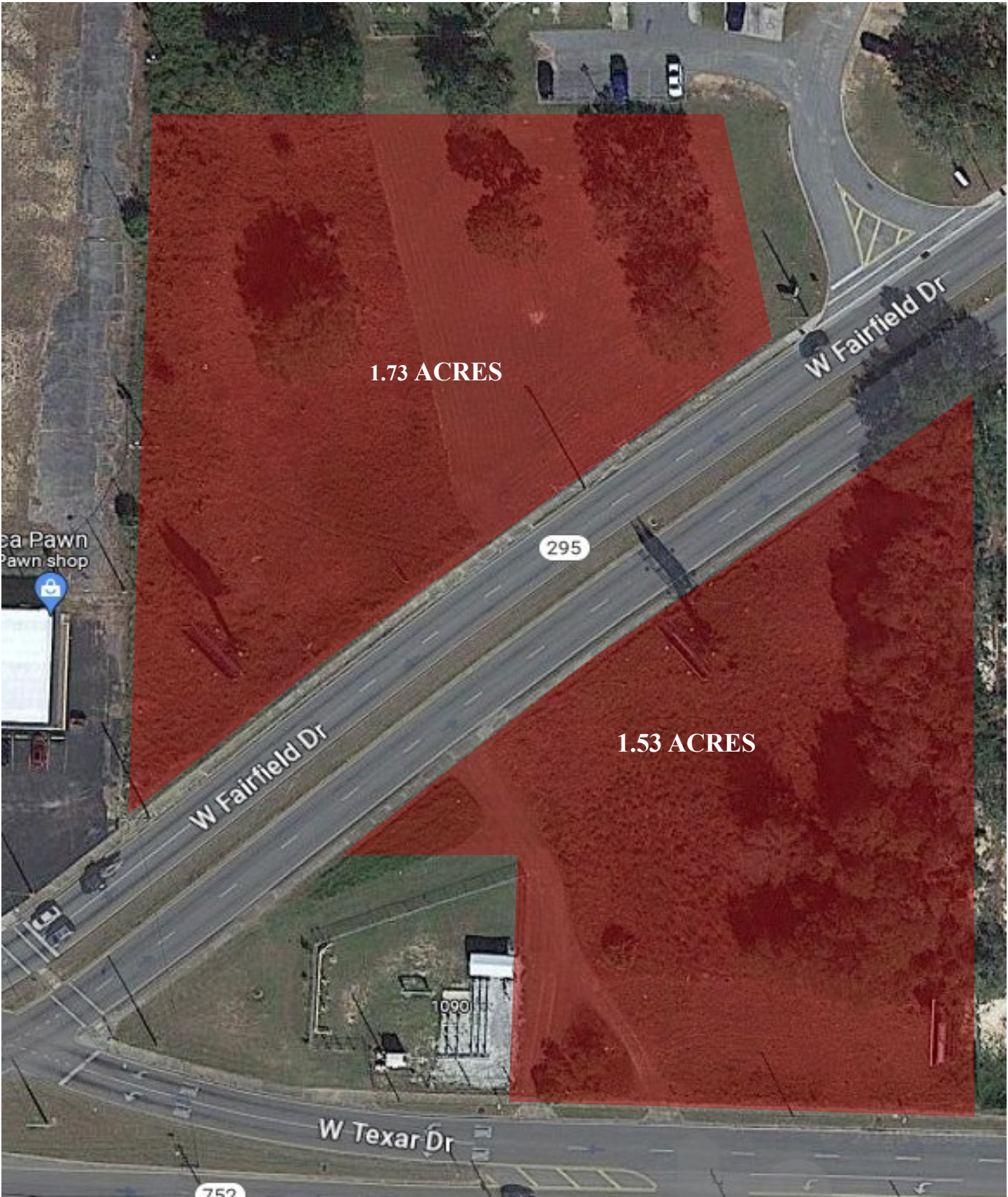
ARIEL VIEW/ SITE LOCATIONS