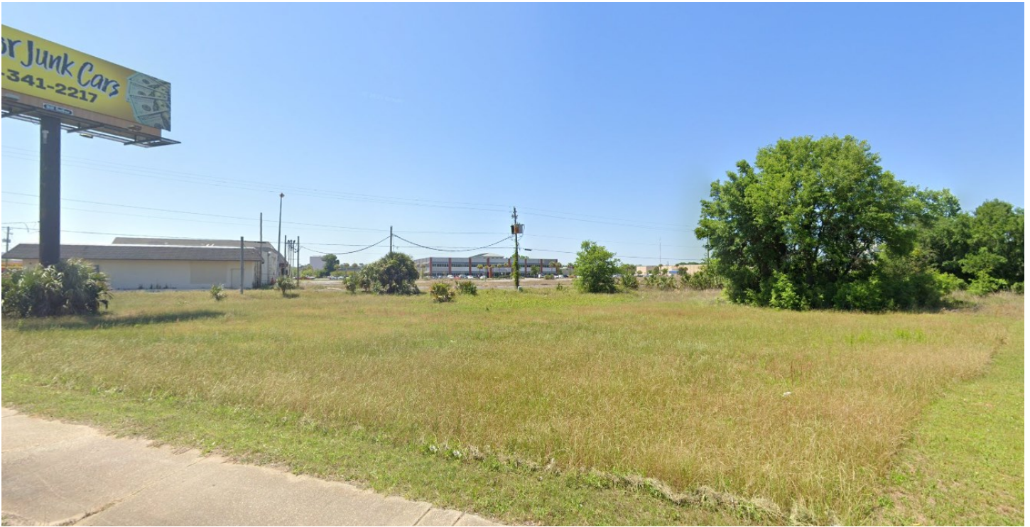
NORTH PARCEL 1.73 ACRES $499,000.00