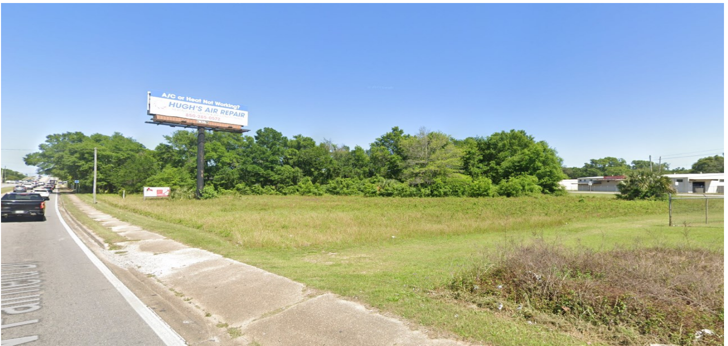
SOUTH PARCEL 1.93 ACRES $449,000.00