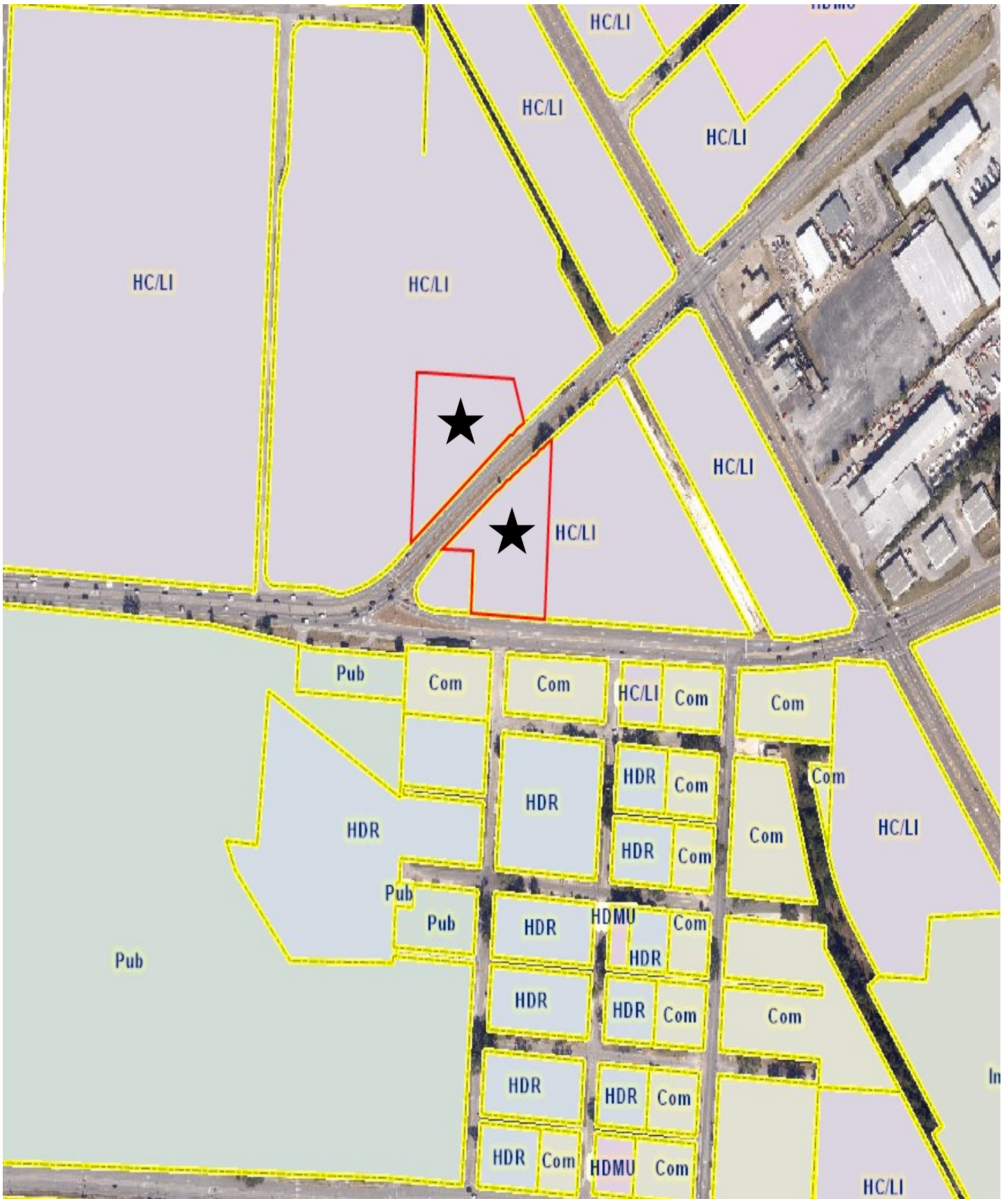
COUNTY ZONING / HEAVY COMMERCIAL - LIGHT INDUSTRIAL